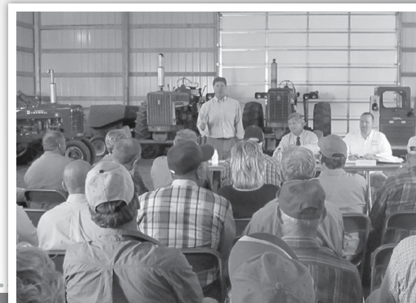
Ron and USDA Secretary Tom Vilsack speak with western Wisconsin farmers about outdated agriculture subsidies and the need for reform to better support family farmers.

Follow Congressman Kind on Flickr: www.flickr.com/photos/49556675@N04/