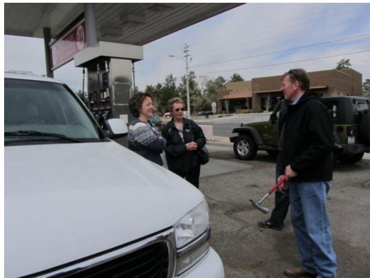
(Congressman Gosar Attends to Cars in Prescott)

I spent the first two weeks of April working in Arizona meeting with citizens and discussing transportation issues with local officials and business leaders. Though I always enjoy my journeys around the state, my car's fuel gauge, and thus my wallet, seemed painfully empty. That is why I spent one afternoon as a gas station attendee for Thumb Butte Gas and Convenience in Prescott to pump residents' gas, and to find out how gas prices were impacting their daily lives.