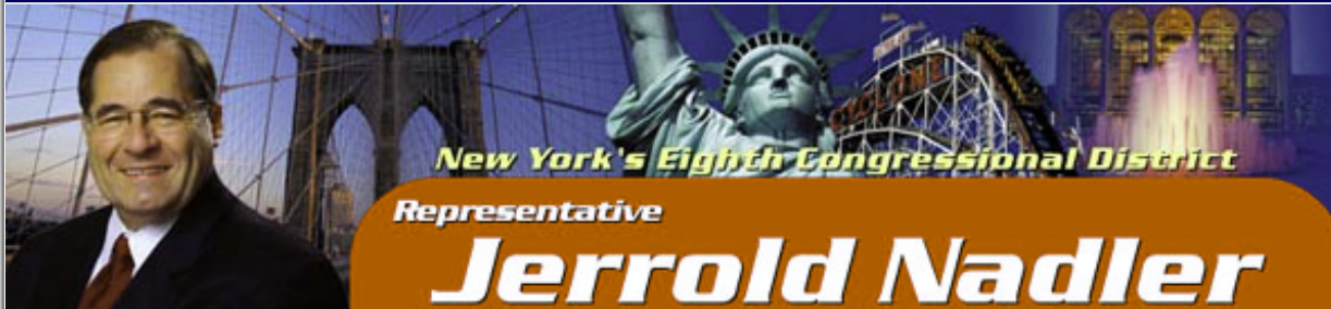
Representative Jerrold Nadler - New York's Eighth Congressional District