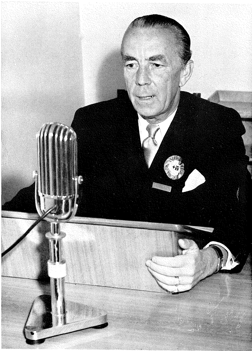
COUNT FOLKE BERNADOTTE President of the XVIIth International Red Cross Conference.