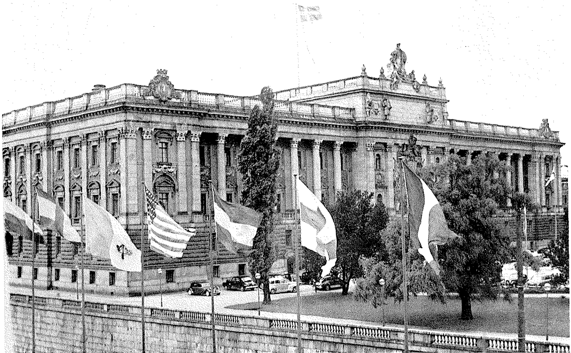
THE SWEDISH PARLIAMENT Seat of the Conference