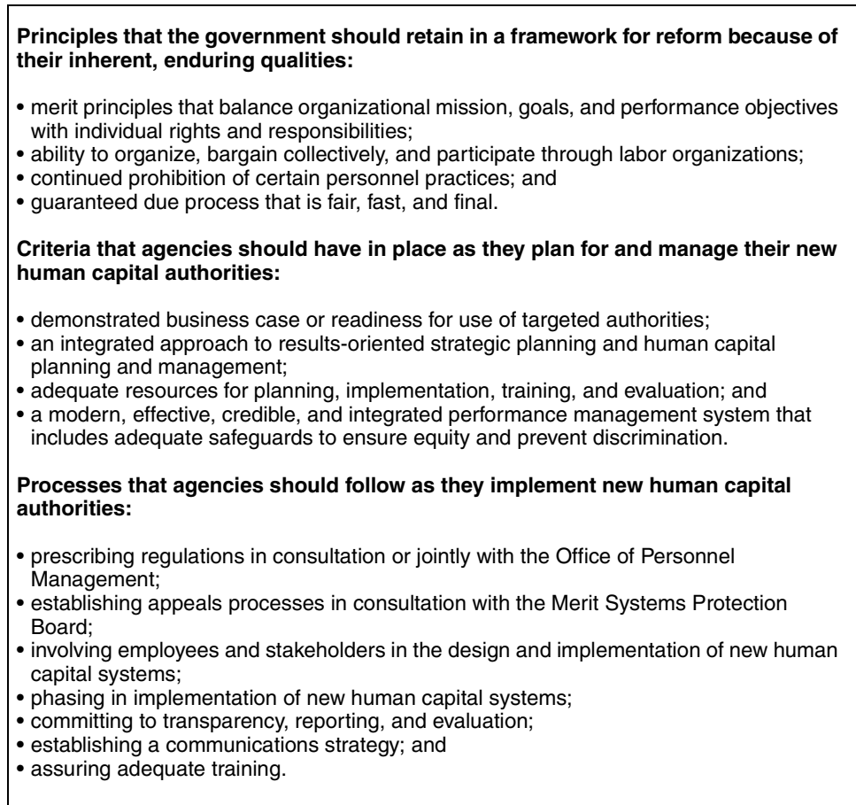
Figure 1: Principles, Criteria, and Processes