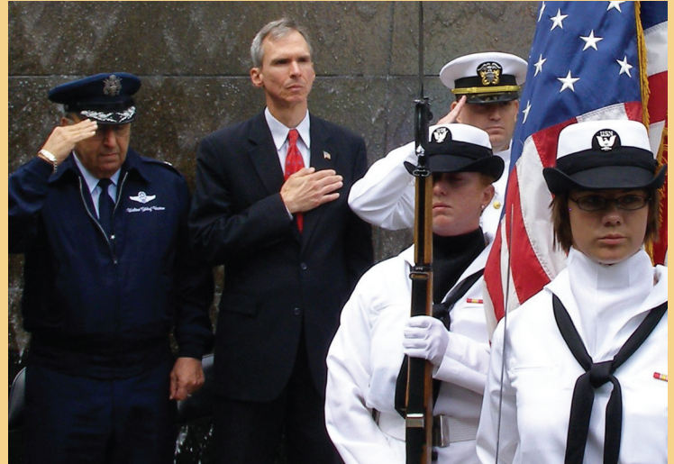
At the Soldier Field Veterans Memorial, Rep. Lipinski discussed the importance of ensuring veterans receive the best possible treatment and care.

Congressman Lipinski (pictured in Justice discussing his efforts) can also assist veterans who were wounded or injured in a combat zone with obtaining Silver Star Service Banners from the Silver Star Families of America.