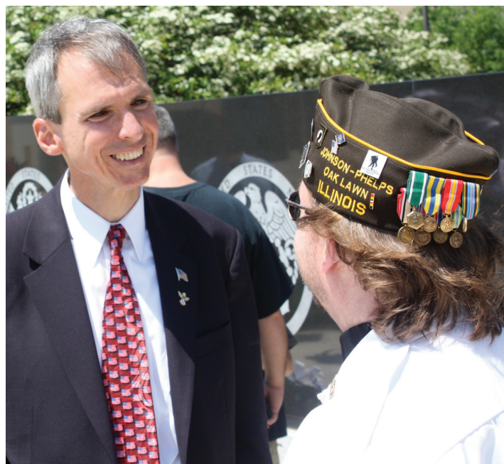
In Oak Lawn, Rep. Lipinski discusses his work in Congress to support America's veterans.

For more information, call 312-886-0481.