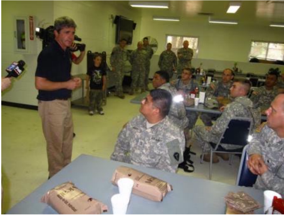
Congressman McCaul has lunch and visits with members of the Texas Army National Guard at Camp Swift before their deployment to Iraq later this year.