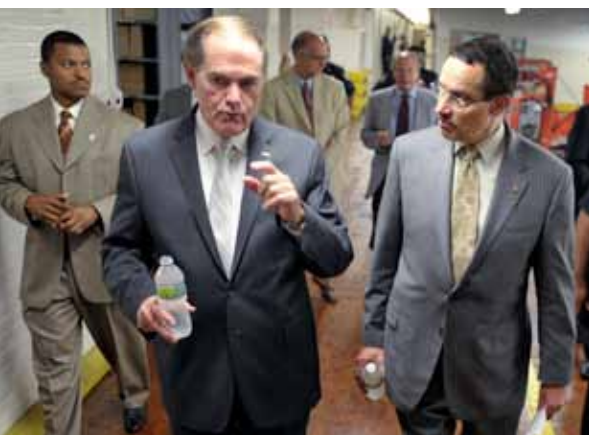
Public Printer Bill Boorman and Washington, DC, Mayor Vincent Gray following a tour in July of GPO's smart card production facility, where GPO is producing the DC One Card for the District government.

Throughout its history, GPO has been an important part of the District of Columbia and today employs approximately 300 DC residents. GPO also performs work for the District on a reimbursable basis, including design services for a number of District agency brochures and annual reports. In July 2011 DC Mayor Vincent Gray visited GPO to promote the DC Summer Youth Employment Program. GPO placed 26 District youths in various summer positions, giving them the opportunity