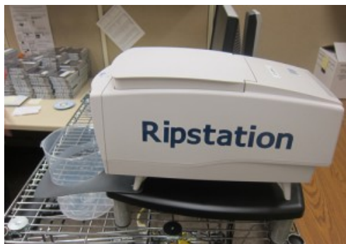
The Ripstation.

They're the red-headed stepchildren of the digital age. They're neither retro chic (all things being relative, of course) like the server arrays that support " big data ," nor are they as cute