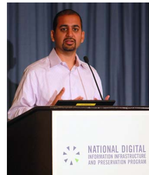
Anil Dash

Until recently, he noted, knowledge was constrained and localized in the service of "managing, filtering, reducing and winnowing information to reach definitive answers." With the web, knowledge has been set free to grow and evolve in networks.