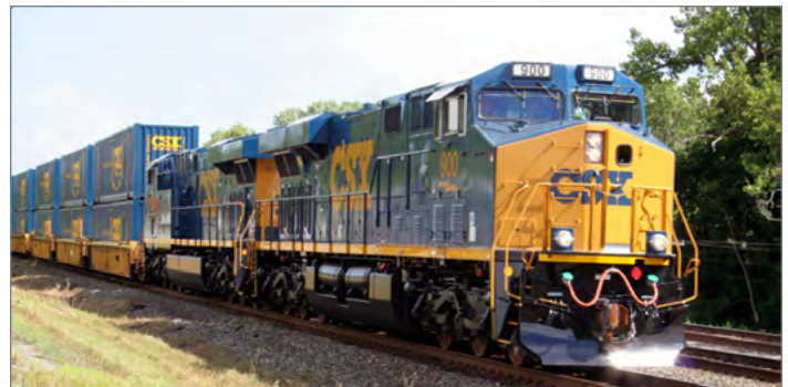
Double-stacking enables the National Gateway project to increase capacity without increasing its footprint

economic competitiveness, state of good repair, livability and environmental sustainability and were evaluated against these criteria. Applicants were also evaluated on contributions to economic recovery, a priority for DOT, as well as innovation and partnership.