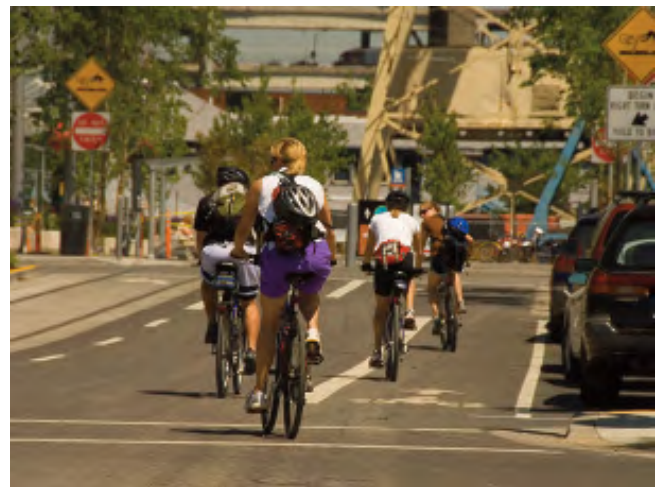
Portland’s SW Moody Street Project focuses on multiple modes of travel

TIGER’s use of a competitive, merit-based project selection process and broad project eligibility enables DOT to select transformative projects and track the effectiveness of the investments to ensure that our scarce resources are used for their best effect.