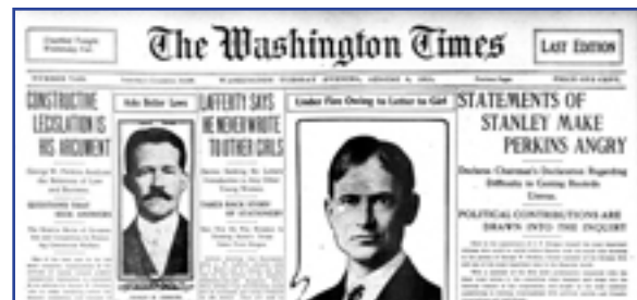
Front page of the August 8, 1911 Washington Times from Chronicling America, Library of Congress collection

I have the distinct pleasure of working with the Repository Development Center (RDC), which is responsible for the development of a number of web applications and tools that support the acquisition, management, preservation and delivery of digital collections. Chronicling America is one of those websites.