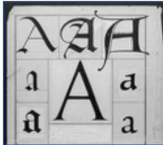
Goudy's original drawing for a plate in The Alphabet. P&P Division, The Library of Congress.

By Martha Anderson – I am beginning a series that will explore the topic of digital preservation in an alphabetical way. Each post will use a word or phrase as a device to explore a concept and point to a what I hope is a useful resource for understanding a specific aspect of the practice of digital preservation. A is for Archives is the first in the series on “ The Signal .” •