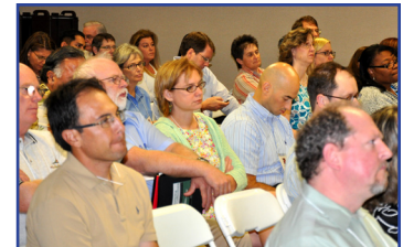
Conference attendees listening to keynote addresses.