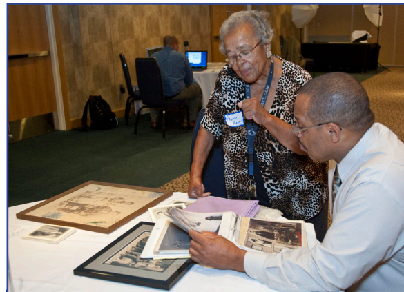
Save Our African American Treasures.

The Library of Congress participated in Save Our African American Treasures , which was held in Topeka, Kan., during August 14-15. The National Museum of African American History and Culture sponsored the public event to offer advice about preserving personal collections.