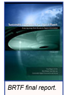
BRTF final report.

The Blue Ribbon Task Force on Sustainable Digital Preservation and Access sponsored an engaging symposium on April 1, 2010, to consider these issues. A National Conversation on the Economic Sustainability of Digital Information focused on the findings of the group's recent report, Sustainable Economics for a Digital Planet: Ensuring Long-Term Access to Digital Information .