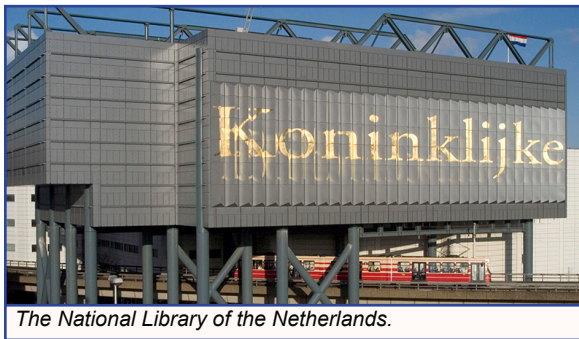
The National Library of the Netherlands.

The National Library of the Netherlands is a small institution that plays a large role in the world of digital preservation. The library (known in Dutch as the Koninklijke Bibliotheek and more commonly as the KB) is a leader in supporting practical approaches to preservation through research and collaboration.