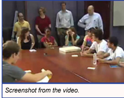
Screenshot from the video.

Today's teenagers depend on digital information for education and entertainment, but may not know that digital information can easily be lost. What do these "digital natives" think about the permanence – or impermanence – of digital content?