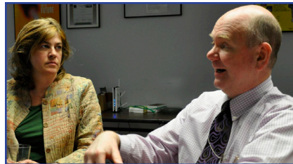
Library of Congress staff speaking at the webinar.

Library staff also participated in a January webinar focusing on digital preservation and use of social media as part of a Federal Web 2.0 Webinars series.