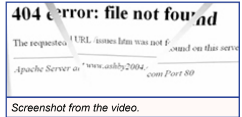
Screenshot from the video.

Read more about the meeting at digitalpreservation.gov . •