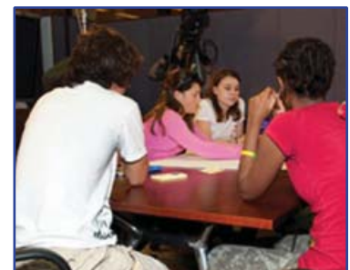
Arlington high school students discuss what digital items should be preserved.

NDIIPP has long been interested in gauging digital preservation awareness in the wider community, and the visit was an opportunity to both engage with the next generation of digital technology users while also educating. Discussion with students brought out examples of how digital archiving concepts have not fully penetrated the high school student consciousness.