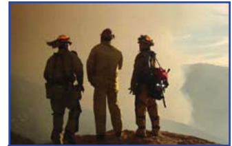
Screenshot of the U.S. Department of the Interior website, from the 2007 Southern California Wildfires Web Archive.

CDL built the WAS to support the Web-at-Risk project , which is funded by the National Digital Information Infrastructure and Preservation Program and the University of California. Read more about the WAS at digitalpreservation.gov .