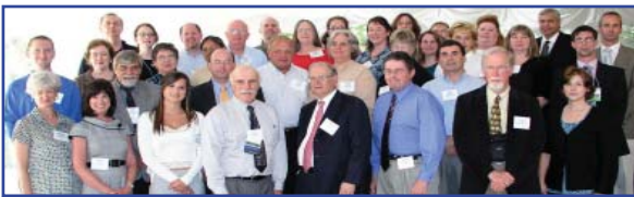
Members of the Washington Multi-State Preservation Consortium.

Library of Congress staff played an active role at the recent National Association of Government Archives and Records Administrators annual conference, held in Seattle, WA. NDIIPP staff presented details about the Preserving State Government Information initiative . They also participated in a meeting of the Washington Multi-State Preservation Consortium , which included representatives of current as well as prospective partners.