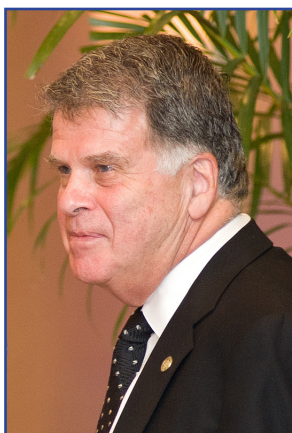
Archivist of the United States David S. Ferriero.