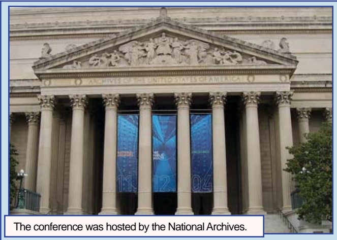
The conference was hosted by the National Archives.

A one-day conference, “Digitizing for Preservation and Access: Past is Prologue”, was held at the National Archives and Records Administration in Washington, D.C. on March 26, 2009. In addition to staff from NARA, the Library of Congress and other federal government agencies, there were participants from university libraries, state archives and a representative from the National Archives of the UK.