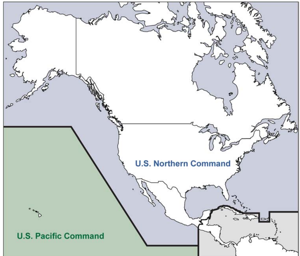
Figure 2: Relevant Areas of Responsibility for U.S. Northern Command and U.S. Pacific Command