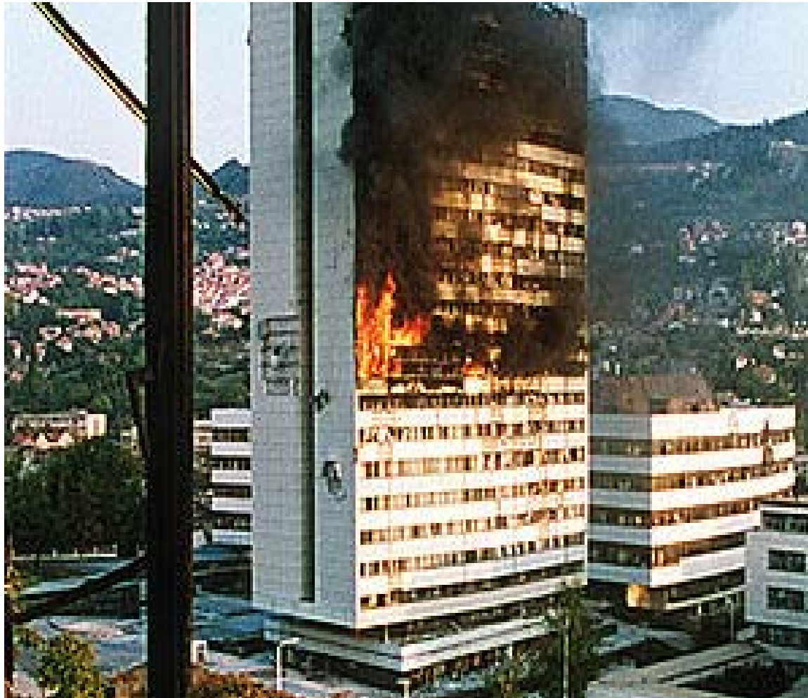
Sarajevo, 2 nd of May 2012, Bosnia and Herzegovina Government Building