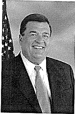
C.A. Dutch Ruppertsberger Member of Congress