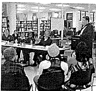
Cong. Ruppertsberger speaking at a 2008 Financial Aid Town Hall