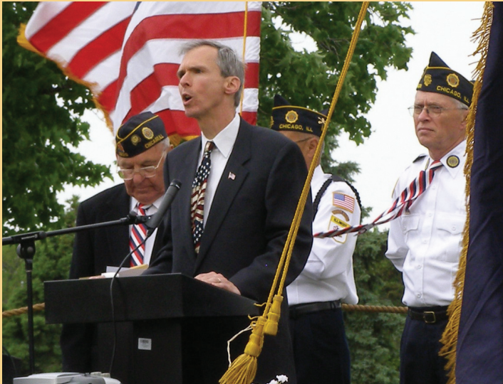
Congressman Lipinski speaks about the need to honor veterans' sacrifices and his vote to raise awareness of National Military Appreciation Month.

★ CONGRESSMAN LIPINSKI WORKS FOR VETERANS ★