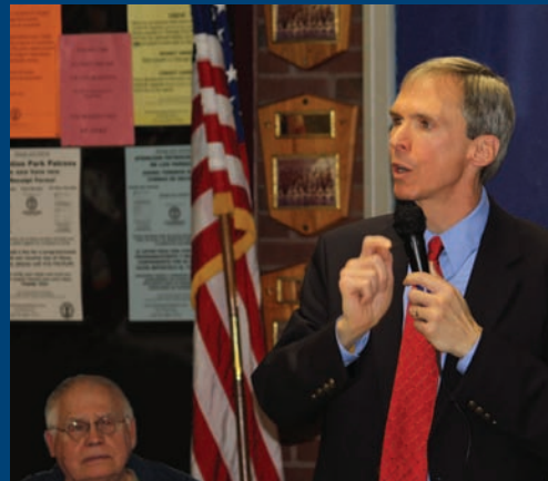
Rep. Lipinski talks about the health care bill with constituents in Chicago.

The Senate bill does little to rein in skyrocketing health care costs, which have nearly doubled in the last 10 years. The Congressional Budget Office says the bill will do little or nothing to slow escalating premium costs for the significant majority