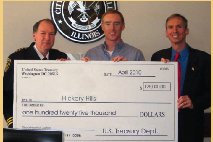
Mayor Mike Howley thanks Rep. Lipinski for obtaining $125,000 for the Hickory Hills Police Department for critical 9-1-1 equipment.