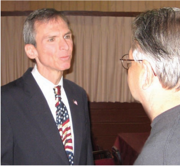
Rep. Lipinski discusses his opposition to the Wall Street bailout with a constituent in Summit.

Despite near double-digit unemployment, Wall Street banks continue to dole out seven- and eight-figure bonuses to the same people who helped trigger the financial meltdown and the recession. As the only Chicago-area Democrat to have voted against the $700 billion Wall Street bailout all three times, Congressman Lipinski continues to fight to ensure that big banks repay in full the enormous debt they owe the American taxpayer. He is a cosponsor of the Wall Street Bonus Tax Act, H.R. 4426, which imposes a 50% tax on all bonus compensation over $50,000 at bailed-out banks and uses the money to fund low-interest loans for worthy small businesses. We must make sure Wall Street bankers understand something the rest of the country knows all too well but that they seem to have forgotten: there is no such thing as a free lunch.