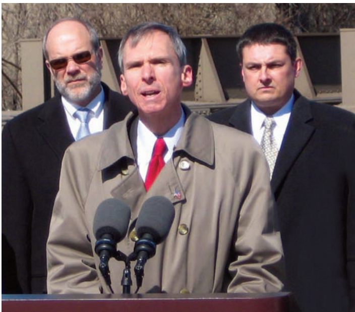
Rep. Lipinski announces construction on the Englewood Flyover will begin this year as a result of $133 million in federal funding he helped secure.

Congressman Lipinski was recently joined by a host of local and national leaders to announce that construction will begin this year on the Englewood Flyover. This $133 million project will create an estimated 1,450 jobs, according to the Chicago Department of Transportation, and immediately eliminate delays on Metra's Rock Island line, which has stops in Beverly and Morgan Park. In addition, it is the critical first step toward sharply reducing delays on Metra's Southwest Service line. The flyover, which involves building a bridge to carry the Rock Island tracks over the Amtrak tracks at 63rd Street in Chicago, will also help make high-speed rail possible.