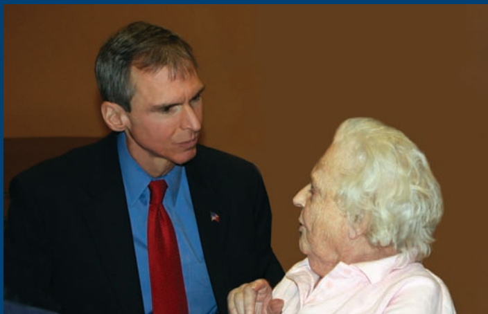
Rep. Lipinski explains his commitment to strengthening Medicare and preserving seniors' access to top-quality care with a senior in Chicago Ridge.

There is no doubt reform is needed to lower soaring health care costs and make insurance coverage more affordable and accessible. That is why Congressman Lipinski has always worked to improve America's health care system. Last November, after helping to make numerous improvements to the House bill, he voted