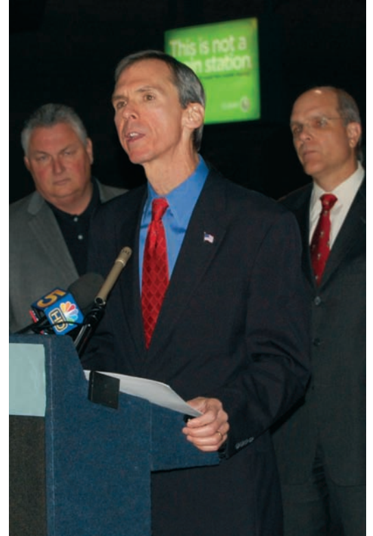
Rep. Lipinski calls for additional funding for the CREATE rail modernization program at Ogilvie Station in Chicago.

These projects are all part of the CREATE rail modernization program. CREATE is creating jobs, shortening commutes, reducing shipping times, lowering fuel usage, enhancing safety, and helping to ensure Chicago remains the nation's transportation hub for decades to come.