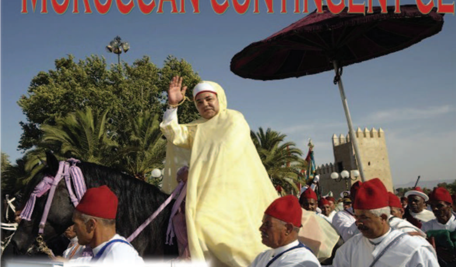
King Mohammed VI Allegiance Ceremony