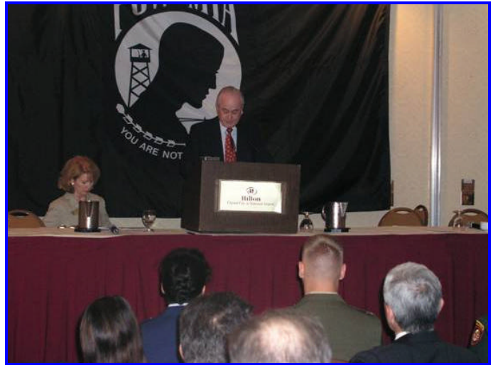
DASD Jennings addresses family members of the servicemen missing from the Vietnam War.

Representatives from the Department of Defense and the Department of State discussed policy issues and fielded questions from family members. U.S. Government specialists presented information on myriad topics including: the challenges in recovery and