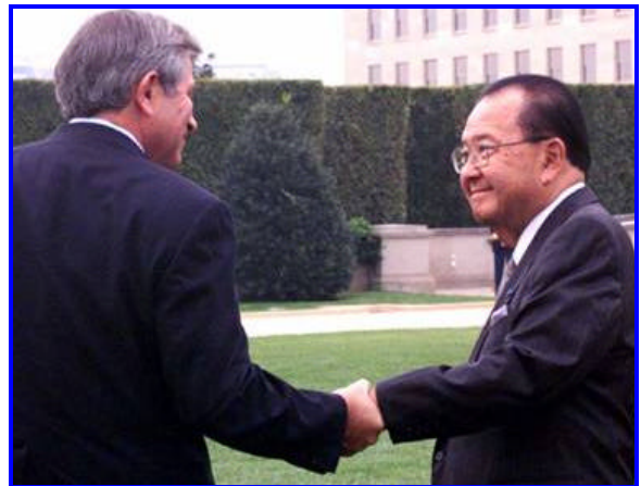
Deputy Defense Secretary Paul Wolfowitz shakes hands with WWII Medal of Honor recipient Senator Daniel Inouye who was the guest speaker at the Pentagon's National POW/MIA Recognition Day ceremony.

The character of the nation is reflected in the character of those who serve, Myers further said. "And those we remember today," he added, "reflect the very best of our nation."