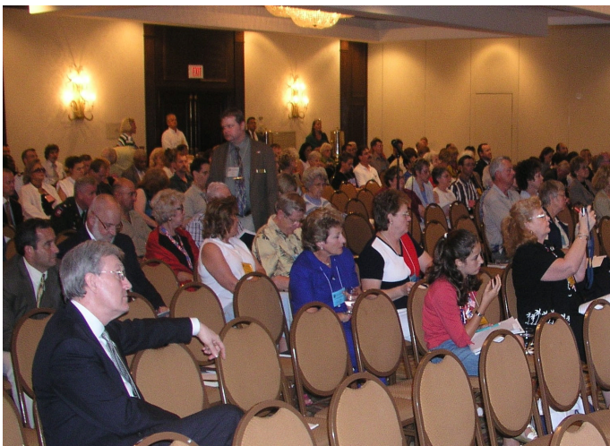
More than 200 family members of servicemen missing from the Vietnam War attended the DPMO-hosted two day annual meeting in June.

In addition to DoD hosting the family members for a complimentary Service Casualty Luncheon, DPMO provided the families a visit to key Washington DC monuments to include the Vietnam War Wall Memorial, the Korean War Memorial, and the recently dedicated World War II Memorial.