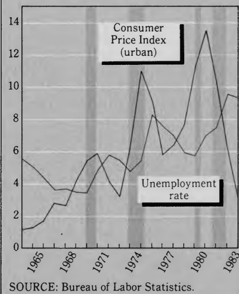
Chart 1 Inflation and the Unemployment Rate Annual percent change

interest rates. Accelerating inflation led to more uncertainties and risks in financial markets as well as to distortions in savings and investment. These distortions eroded the stock of productive capital, lowered worker productivity, and contributed to even higher unemployment rates. Although there are certainly many who would disagree, economists increasingly have come to realize that the central bank can do little to promote full employment except provide an economic environment that includes a sound financial system and a stable price level.