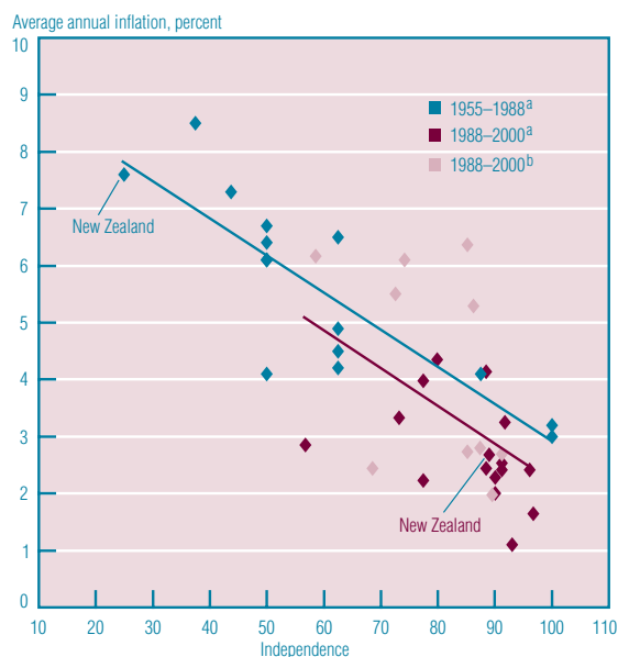
FIGURE 3 AVERAGE INFLATION VERSUS INDEPENDENCE

a. For New Zealand, Spain, Italy, Belgium, France, Norway, Australia, Sweden, U.K., Denmark, Japan, Netherlands, Canada, U.S., Germany, and Switzerland.