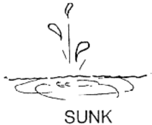
EXAMPLE #2 - DISCREPANCIES