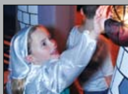
BAHRAIN SCHOOL HOSTS SPOOKTACULAR, P. 2