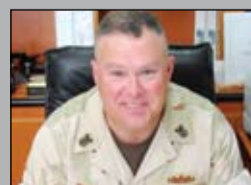
FROM THE DESK OF THE COMMAND MASTER CHIEF, P. 3