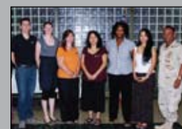
NSA APPRECIATES OMBUDSMEN, P. 4