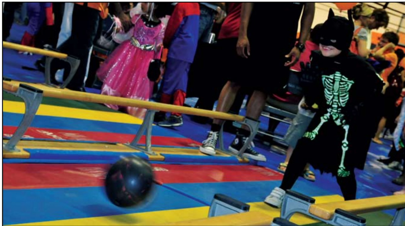
A child bowls for candy prizes at the fourth annual Bahrain School Spooktacular event, Oct. 27.