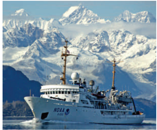
NOAA Ship Fairweather in the Gulf of Alaska with namesake Mt. Fairweather.

NOAA's mission is to understand and predict changes in the Earth's environment, from the depths of the ocean to the surface of the sun, and to conserve and manage our coastal and marine resources. Join us on Facebook , Twitter and our other social media channels .