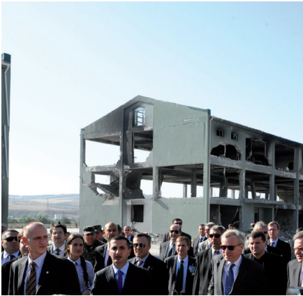
The then NATO Secretary General Jaap de Hoop Scheffer and Allied Ambassadors visit a camp in Gori on 16 September 2008, where some 2200 displaced people had found shelter after the August conflict.