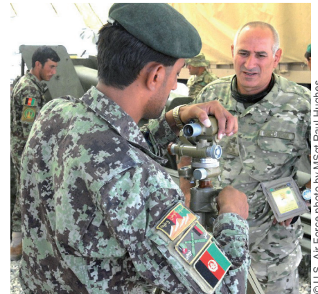
A Georgian soldier observes an Afghan National Army soldier assemble an artillery tool at Camp Hero in Kandahar, Afghanistan, in July 2011.

Georgian troops also worked alongside NATO troops in the peacekeeping operation in Kosovo from 1999-2008, providing a company-sized unit to the Kosovo Force (KFOR) as part of the German brigade there, and an infantry platoon within a Turkish battalion task force.