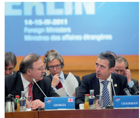
Georgian Foreign Minister Grigol Vashadze speaks to NATO Secretary General Anders Fogh Rasmussen at a meeting of the NATO-Georgia Commission in Berlin on 15 April 2011. The Allies welcomed Georgia’s strong performance in defence reform and its valuable contribution to the NATO-led force in Afghanistan.

As an Alliance based on democratic values, NATO has high expectations of prospective new members and urges Georgia to continue to pursue wide-ranging reforms to achieve its goal of Euro-Atlantic integration. The Allies strongly encourage the Georgian government’s continued implementation of all necessary reforms, particularly democratic,