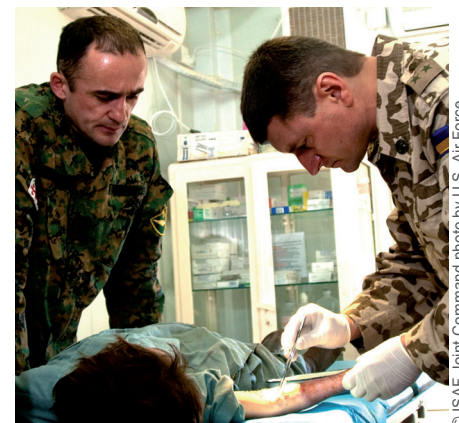
A Georgian military doctor ( left ) works with a Ukrainian colleague to treat a young Afghan boy for burn wounds at the medical facilities of the multinational Provincial Reconstruction Team in Chaghcharan, Afghanistan.