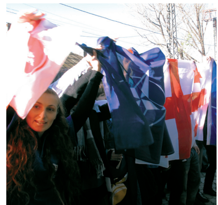
A majority of Georgians support their country's aspirations to join the Alliance.

One key public diplomacy objective for both the Georgian government and NATO is to inform, educate and manage the expectations of the population about NATO membership, including rights and obligations. Georgia is on the right track and has made significant progress on a wide-ranging reform package. It needs to continue on this path, adopting and implementing further necessary reforms, to realize its membership aspirations.