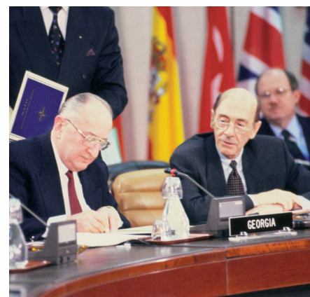
Then Georgian Foreign Minister Alexander Chikvaдзе signs the Partnership for Peace Framework Document on 23 March 1994. This paved the way for practical bilateral cooperation between NATO and Georgia, as well as setting out key partnership values and commitments.

The purpose of these commitments and of the EAPC and the PfP programme as a whole is to build confidence and transparency, diminish threats to peace, and build stronger security relationships with the Allies and with other Euro-Atlantic partners.