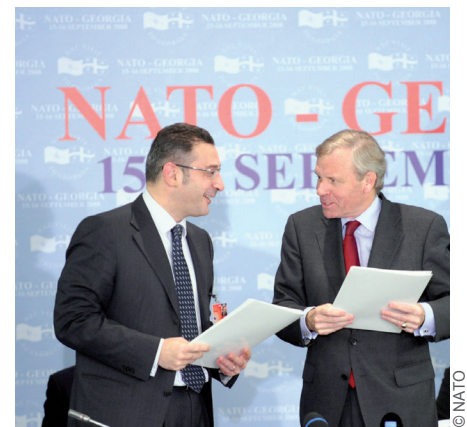
The inaugural meeting of the NATO-Georgia Commission takes place in Tbilisi on 15 September 2008, during a visit to Georgia of the North Atlantic Council, NATO's highest decision-making body.

The Allies agreed to support Georgia, upon its request, in a number of areas. These included assessing the damage to civilian infrastructure