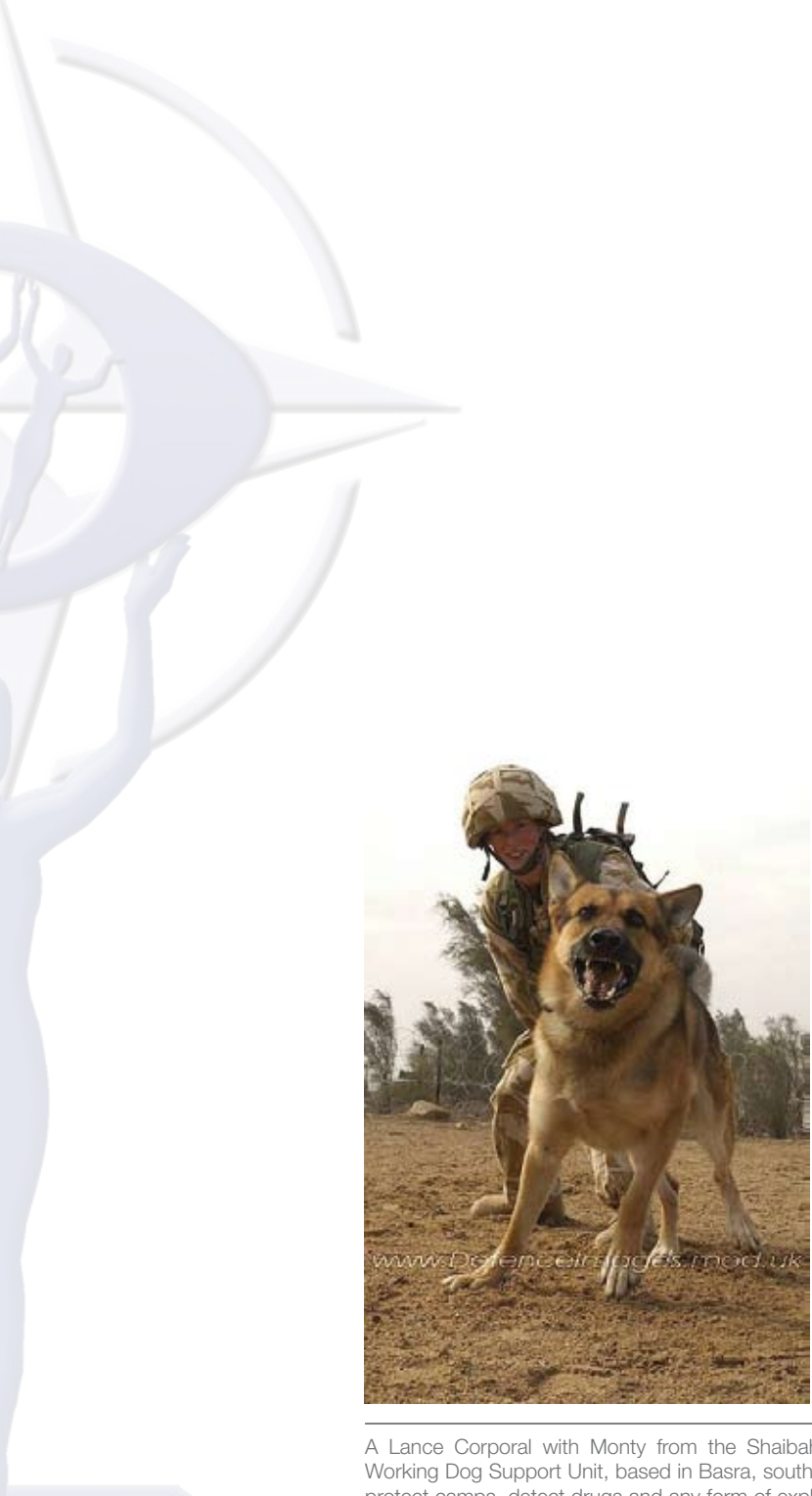
A Lance Corporal with Monty from the Shaibah Dog Section, Theatre Military Working Dog Support Unit, based in Basra, south east Iraq. The dogs are used to protect camps, detect drugs and any form of explosives contained in vehicles and homes. There are 20 specialist and protection dogs stationed in the Shaibah unit. 27/12/2003