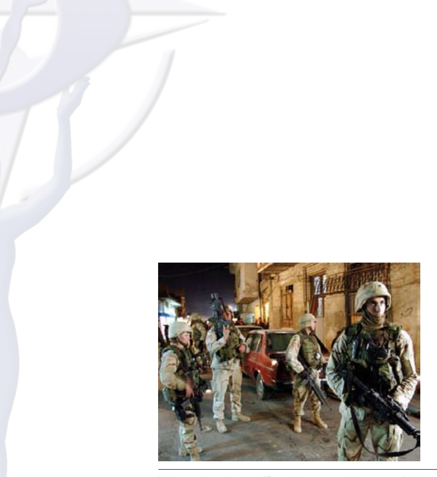
Nightpatrol: a female MP can be seen at left as part of this night patrol