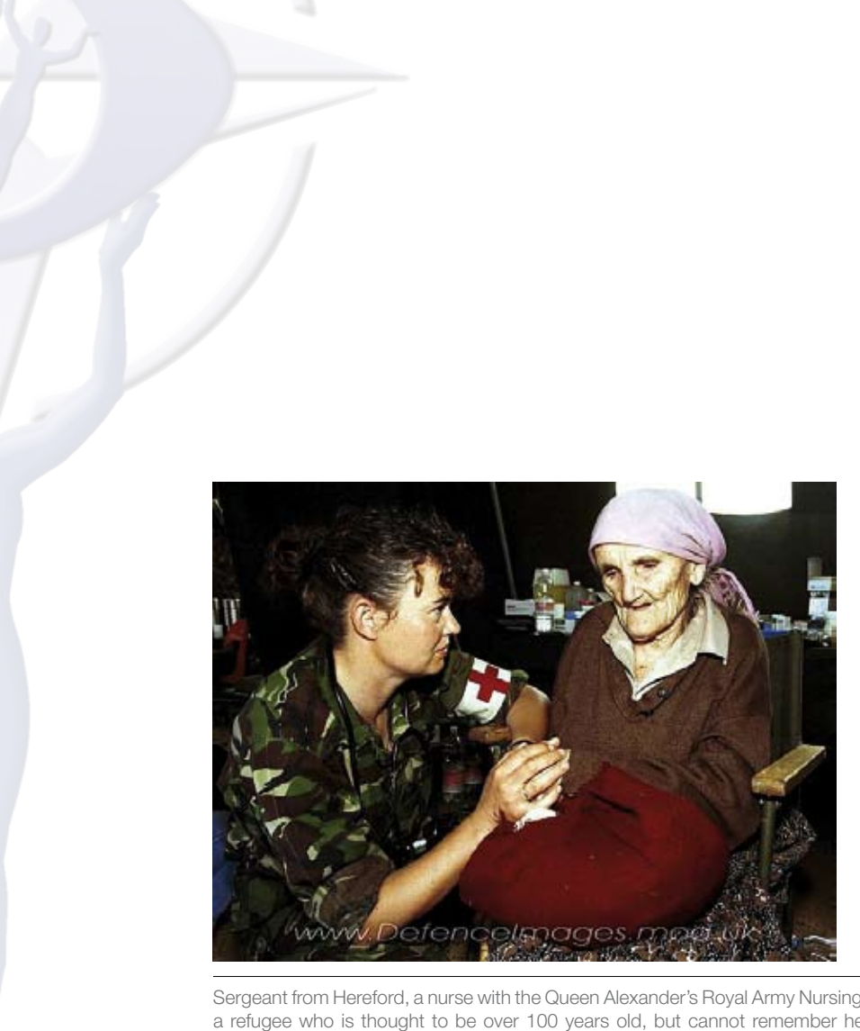
Sergeant from Hereford, a nurse with the Queen Alexander's Royal Army Nursing Corps, comforts a refugee who is thought to be over 100 years old, but cannot remember her exact birthday. She was one of twenty three very old people who were rescued by the British Army at the Blace' crossing point. 08/04/1999