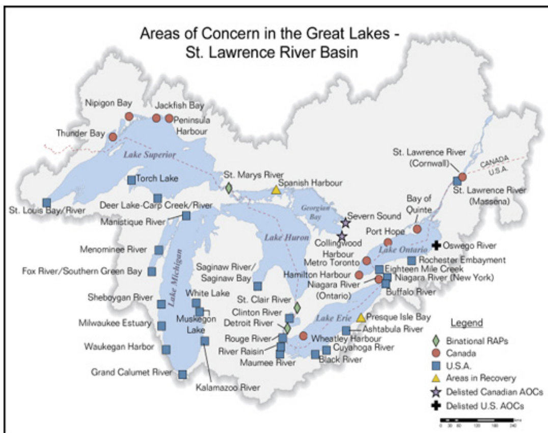
Figure 1.1: Geographic location of U.S. and Canadian AOCs

State or local sponsor commits 35 percent or more of the clean-up cost, the remaining amount (up to 65 percent) is provided in federal funds. The Legacy Act was reauthorized in 2008, extending funding through Fiscal Year (FY) 2010.