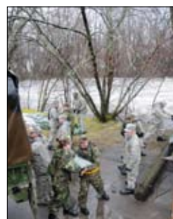
Massachusetts Air National Guardsmen unload sand bags and place them along the banks of the Blackstone River in Blackstone, Mass., to help prevent the rising water from flooding the streets on March 30, 2010.