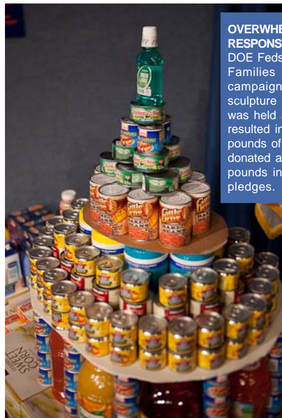
OVERWHELMING RESPONSE: A DOE Feds Feed Families campaign sculpture contest was held and resulted in 2,160 pounds of food donated and 130 pounds in pledges.