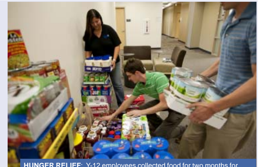
HUNGER RELIEF: Y-12 employees collected food for two months for the annual Feds Feed Families campaign. Federal employees from Y-12 and Pantex together collected a total of 49,342 pounds of food.

Donations made at the Pantex Plant helped stock the shelves of the High Plains Food Bank. Every month, the food bank helps approximately 68,000 people in the Texas Panhandle, including elderly, handicapped individuals and children. During the