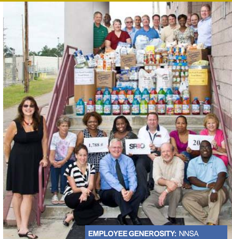
EMPLOYEE GENEROSITY: NNSA Savannah River Site Office employees gather for a group photo at the close of the Feds Feed Families campaign.

This equals approximately two and a half times the set goal. DOE and NNSA collectively succeeded in raising awareness about how hunger has an impact in each community.