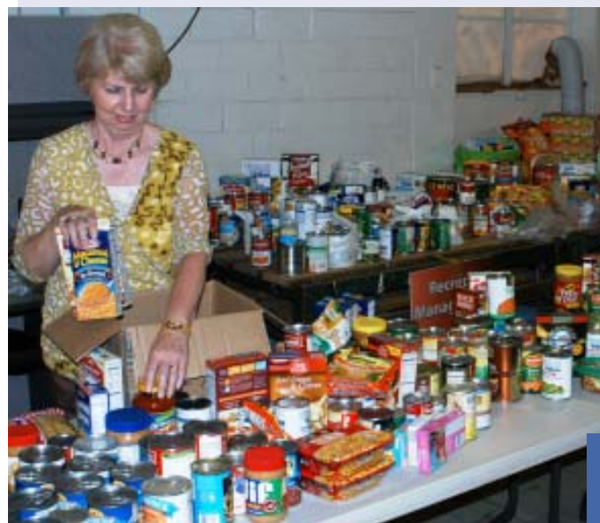
COMMUNITY SUPPORT: Pantex Plant employees donated 25,084 pounds of food to help stock the shelves of the High Plains Food Bank.