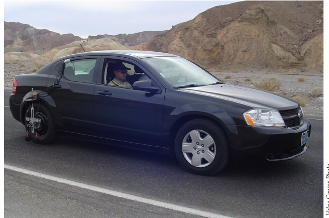
Vehicle outfitted to gathering TNM noise data in real-world conditions.

The Volpe Center has developed and maintains the Traffic Noise Model (TNM) for the FHWA Office of Natural and Human Environment to use in data analysis. The National Park Service is also a major sponsor of this research, and the Center has assisted the NPS Natural Sounds Program and other initiatives to measure, model and mitigate highway-related noise emissions. The Center also supports the NPS Air Tour Management Plan, which seeks to mitigate the impact of noise from commercial aviation on National parklands. In the past year alone the Center has quantified the effects of meteorological conditions, especially temperature, on highway sound levels; and Center staff participated in On-Board Sound Intensity (OBSI) comparison studies of noise on several highways near Charlotte, NC as well as in real-world noise measurements on highways at Death Valley National Park in California.