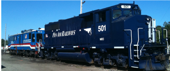
Pan Am Railways Locomotive coupled to FRA T-18 railcar with deployable gage restraint measurement system developed by the Volpe Center for the FRA.

Since the passage of the American Recovery and Reinvestment Act (ARRA) in 2009, the Federal government has made available more than $10 billion to promote U.S. High-Speed Intercity Passenger Rail (HSIPR) service. In support of the Federal Railroad Administration