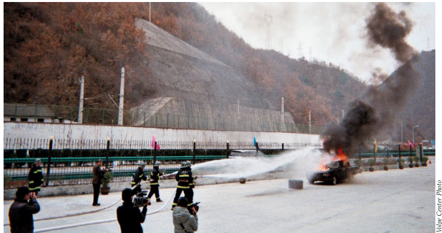
The U.S. DOT delegation witnessed a firefighting demonstration at the Zhongnanshan Tunnel emergency command center in Shaanxi Province, China. The tunnel is the longest two-tube road tunnel in the world.