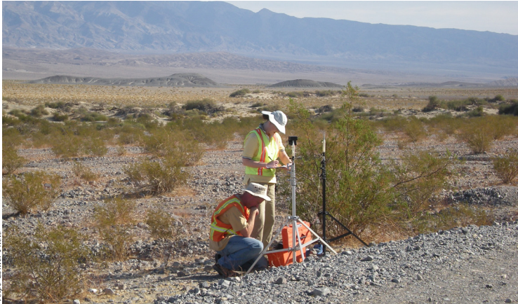
Volpe researchers set up acoustic equipment to measure wayside noise in Death Valley.