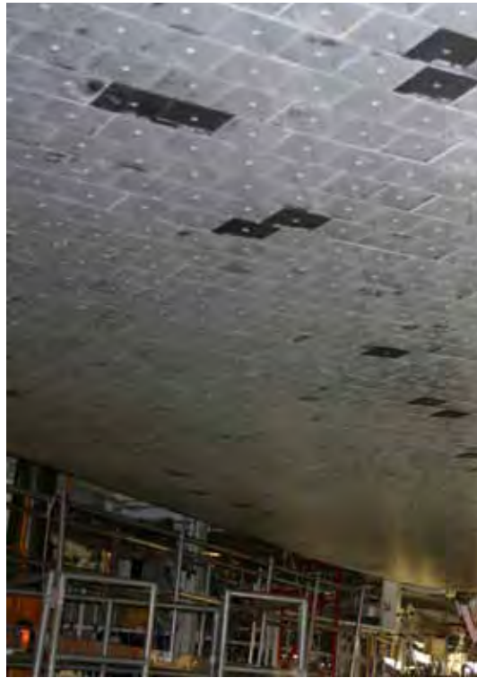
The attendees toured Kennedy Space Center and viewed the Shuttle tiles in the Orbiter Processing Facility.