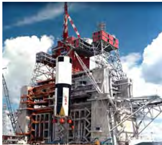
S-IC stage installation into the Hot Fire Stand at MTF, now Stennis Space Center, in 1967.

The monograph is a collection of reminiscences by Apollo experts involved in the early development and testing of the Saturn V Moon rocket's engines. It describes work from decades ago that will continue to carry space exploration forward. The story told is not how one particular engine was built, but rather how ordinary people persisted and were driven to do extraordinary work.