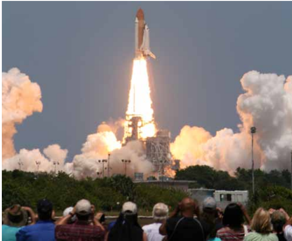
On 14 May 2010, Space Shuttle Atlantis launched on time for its final mission to the International Space Station.