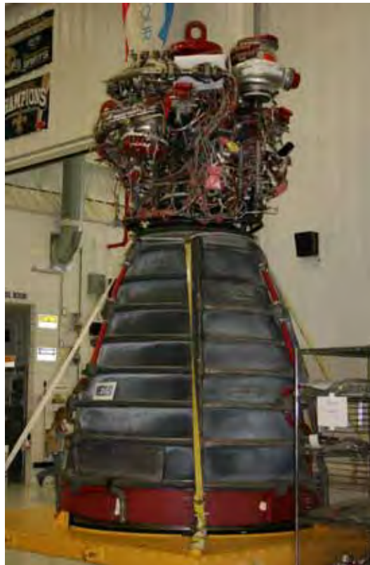
The Space Shuttle Main Engine Processing Facility refurbishes the reusable engines.