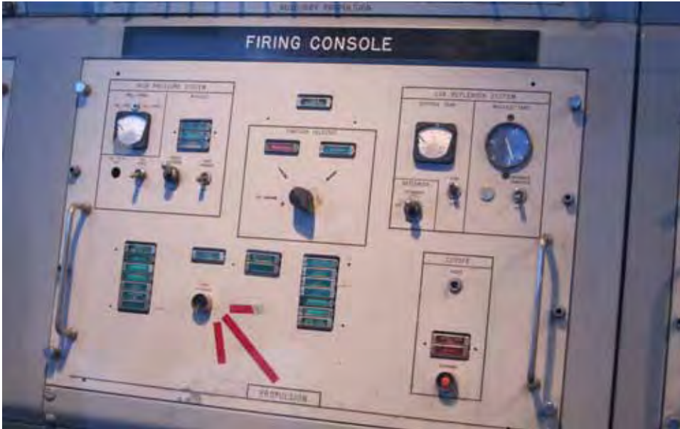
The attendees visited the Cape Canaveral Air Force Station site and the Mercury-Redstone Rocket Facility.