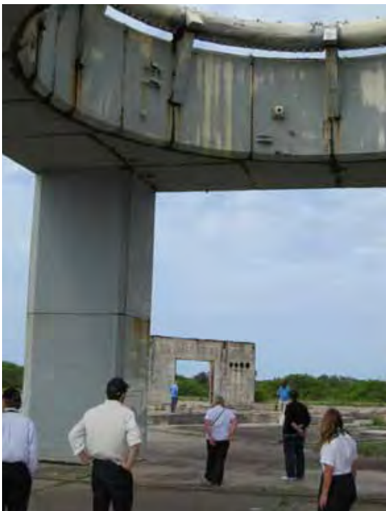
The attendees visited the Apollo 1/Launch Complex 34 site.