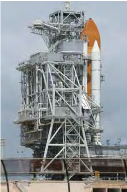
The attendees toured Pad 39A before the Space Shuttle Atlantis launch.