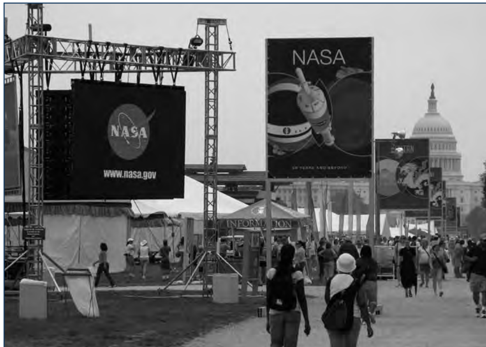
A beautiful view of the length of the Smithsonian's Folklife Festival on the National Mall.