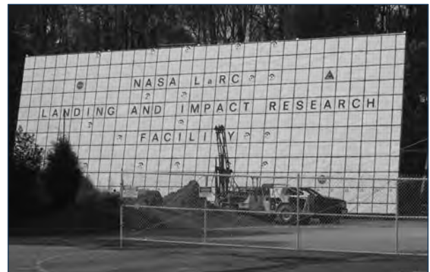
The NASA Langley Research Center Landing and Impact Research Facility is where Neil Armstrong practiced for his future landing on the Moon.

In addition to the presentations and discussion, the group took two tours. The Langley Research Center tour began at the historic and photograph archives. Stops included the historic 30-by-60-foot tunnel, built in the 1930s; the National Transonic Facility, NASA's newest large wind tunnel; the Landing and Impact Dynamics Facility, where Neil Armstrong practiced for his eventual landing on the Moon; and the Structures and Materials lab,