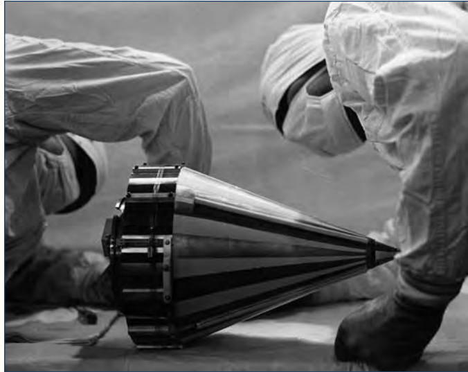
Technicians inspect Pioneer 3, the first probe the Pioneer Antenna tracked.

Associated Universities, and the Blaw-Knox Company. In the 1984 NHL nomination form for the Pioneer Antenna, the National Park Service cites the antenna as being patterned after radio astronomy antennas then in use by the Carnegie Institute in Washington and the University of Michigan. It also outlines significant differences in design, such as the incorporation of a closed-loop device to allow the antenna to provide automatic and continuous contact with spacecraft (see http://www.nps.gov/history/history/online_books/butowsky4/index.htm ).