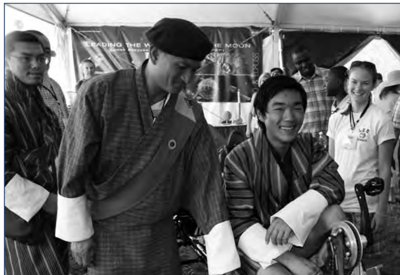
The Prince of Bhutan test-drives one of the winning Great Moonbuggy Race entries.