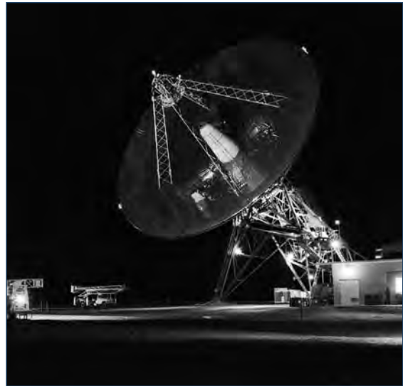
The Pioneer Antenna operating at night during November 1964.