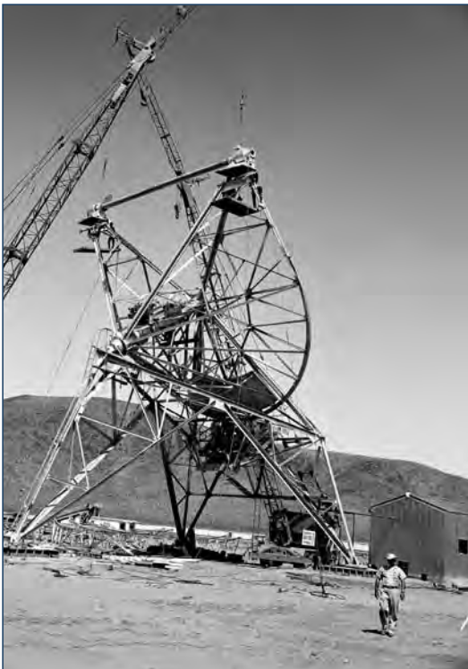
The Pioneer Antenna under construction on 28 August 1958.

Though the Explorer flights provided confirmation of the need for ground-based tracking systems, JPL knew Microlock was not suitable for tracking lunar probes. Under the leadership of JPL's communications chief, Eberhardt Rechtin, a steerable