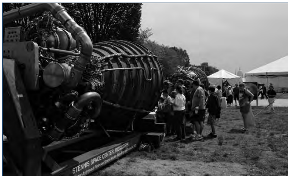
Festival-goers learn about the differences and similarities between Space Shuttle main engines and the J-2 engines that will be used to propel the Ares rockets to the Moon.