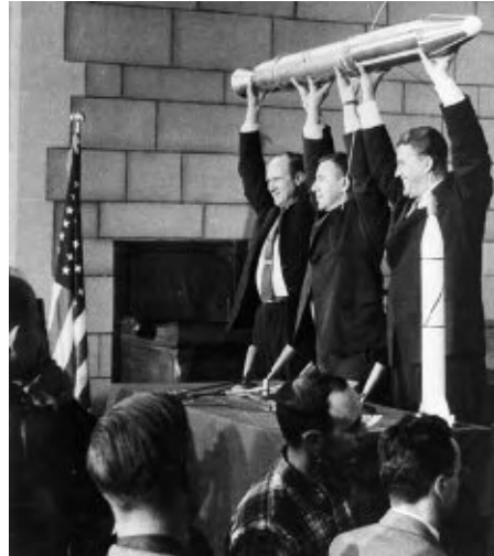
Dr. James A. Van Allen, center, designed and built the instrument on Explorer that discovered the radiation belts that circle Earth. At left is Dr. William H. Pickering, former director of JPL, which built and operated the satellite. At right is Dr. Wernher von Braun, leader of the Army's Redstone Arsenal team, which built the first stage Redstone rocket that launched Explorer 1 .