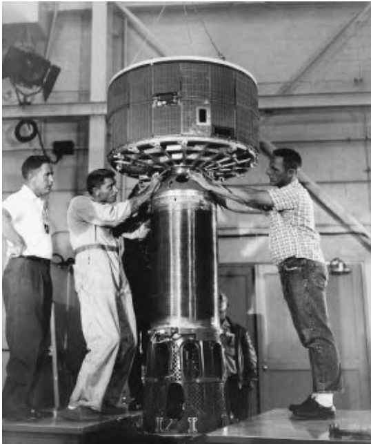
Workers putting the finishing touches on the nation’s first weather satellite, the Television Infrared Observation Satellite (TIROS), which launched from Cape Canaveral on 1 April 1960. The satellite weighed 270 pounds and carried two television cameras, a magnetic tape recorder, timer systems, transmitters, and a power supply. Early photographs provided new information on cloud systems, including spiral formations associated with large storms.