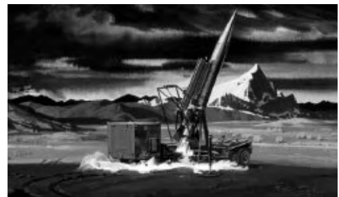
April 2006 Historical Photo of the Month from the JPL Archives Web site. This artist's rendering of a Sergeant missile on a mobile launcher originally appeared on the cover of a 1960 Sergeant brochure.

The year 2006 marks the 10th anniversary of the Historical Photo of the Month (HPoM) at JPL. A historical image is posted each month on the JPL Archives Web site and is directly accessible at http://beacon.jpl.nasa.gov/Histphotos/hpom/HistPhoto.htm . JPL Archivist