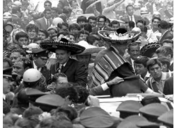
Astronauts Neil A. Armstrong, Edwin E. “Buzz” Aldrin, Jr., and Michael Collins, wearing sombreros and ponchos, are swarmed by onlookers during their visit to Mexico City in September 1969 as part of the “Giant Step–Apollo 11” Presidential Goodwill Tour.