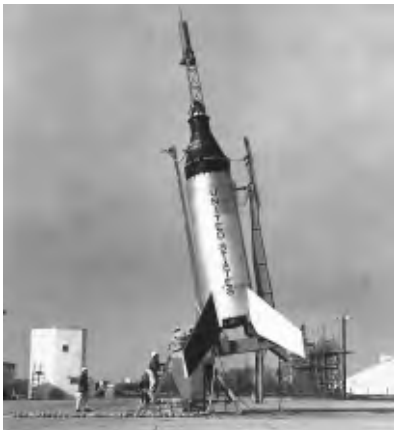
Crews prepare a Little Joe rocket for launch from Wallops Island. The Little Joe project tested escape systems for the Mercury capsule and biomedical conditions during rocket flight in the early 1960s.

With the establishment of NASA in 1958, Wallops' role in the new space agency changed and it was renamed Wallops Station. The station expanded in 1959 to include the Chincoteague Naval Air Station, which now is known as the Wallops Main Base.