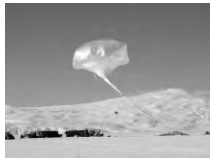
A NASA scientific balloon is launched in McMurdo, Antarctica. About 25 scientific balloons are flown annually from sites around the world.

In the 1970s, Wallops expanded its research role as it became a NASA Center and was renamed Wallops Flight Center. Aircraft began to be used as flying science platforms, conducting missions worldwide. Wallops played a key role in the development of using instruments for use on satellites to measure sea topography. Today, these instruments provide critical information on ocean phenomena such as El Nino.