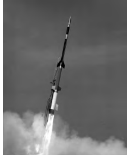
A Black Brant XII sounding rocket takes flight from Wallops Island. The four-stage rocket can fly to altitudes higher than 800 miles.