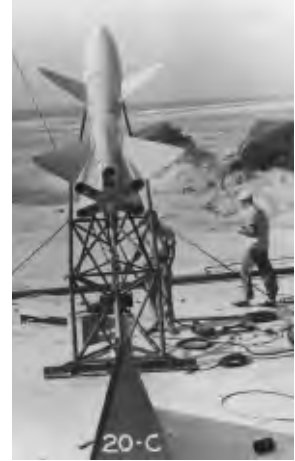
The first research rocket launched from Wallops Island was Tiamat on 4 July 1945.

After being established at Wallops, the focus of the Pilotless Aircraft Research Station was expanded to include studying airplane designs at supersonic flight and gathering information on flight at hypersonic speeds. These tests included aircraft and missile designs from a variety of organizations and corporations including Douglas, McDonnell, Boeing, North American, Lockheed, and Grumman.