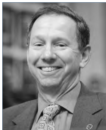
Michael Griffin, 11th Administrator of NASA, at his Senate confirmation hearing on 12 April 2005.

Michael D. Griffin was sworn in as the 11th Administrator of NASA on 14 April 2005. In a special address at NASA Headquarters, Griffin expressed his commitment to the President’s Vision for Space Exploration and to maintaining “vigorous programs in both robotic and human space exploration, as well as in Earth science and aeronautics.” His priorities also include: flying the Shuttle safely until its retirement in 2010; completing the International Space Station; encouraging partnerships with private industry; putting a new Crew Exploration Vehicle into service; and establishing a lunar return program. Griffin emphasized his confidence in the ability of NASA to maintain strong, well-balanced programs in science, exploration, and aeronautics within the context of the Vision for Space Exploration.