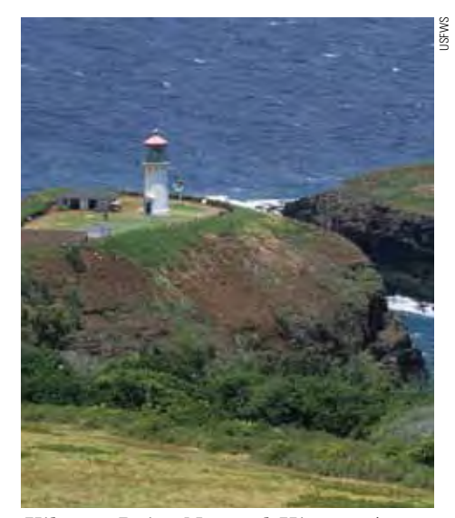
Kilauea Point Natural History Association was a winner in an online Hampton Hotels Save-A-Landmark contest in 2011. Read more in Friends Forward Spring 2011.

• Make sure you can accept online donations through a secure, branded giving page