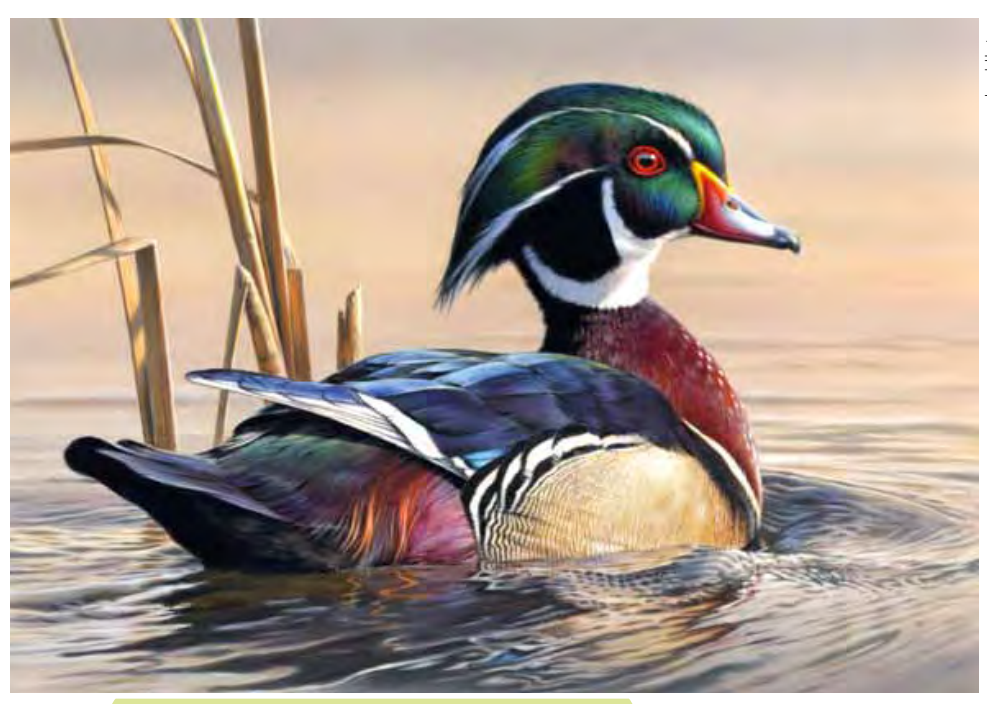
The new Friends of the Migratory Bird/Duck Stamp received a 2012 NFWF start-up grant to develop a website and promote the Migratory Bird Hunting and Conservation Stamp. This year's winning image of a wood duck was painted by Joseph Hautman.

The third and final category of Friends grants are project specific. Examples include conservation education programs for local schools, communities, and private