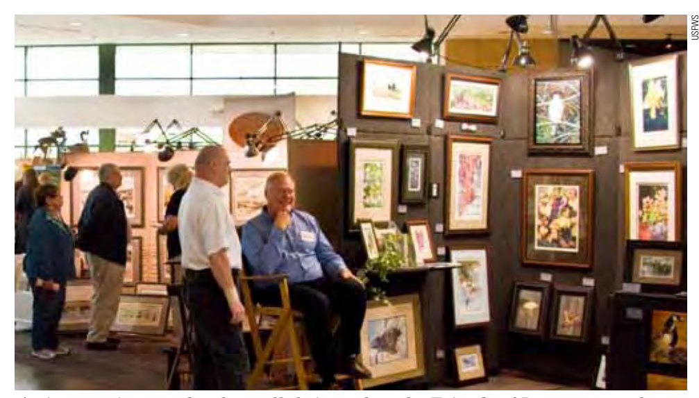
Artists pay $300 per booth to sell their work at the Friends of Patuxent art show in Maryland.

Friends of Patuxent in Maryland sells space rather than items at its