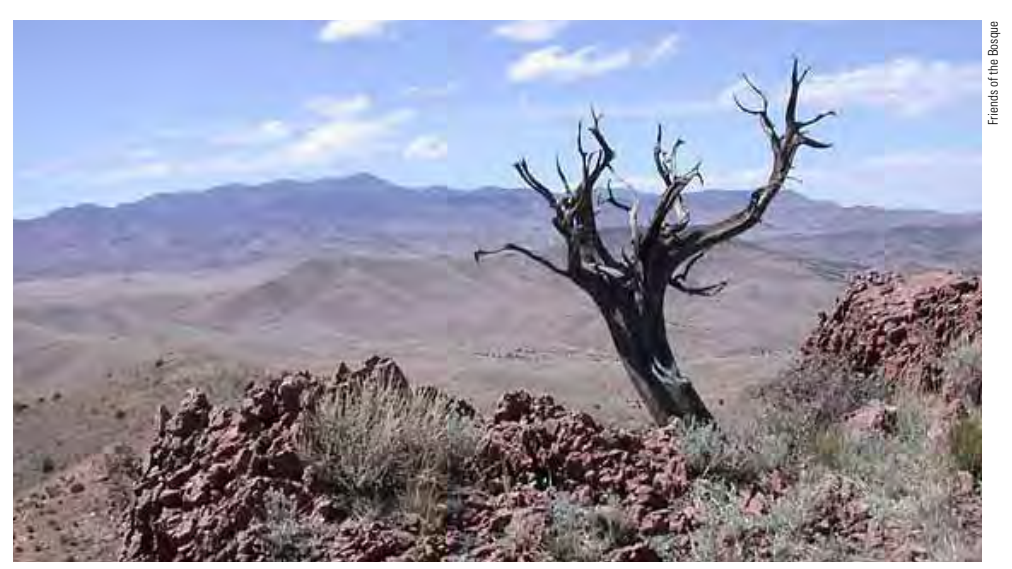
Friends of the Bosque raised funds to complete the purchase of Chupadera Peak for donation to Bosque del Apache National Wildlife Refuge, NM.