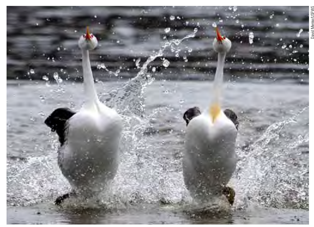
A pair of Clark's grebes display their courtship ritual.

Friends groups support some of the most beautiful, environmentally sensitive and ecologically valuable lands and habitats in the entire country. Can you express that in a concise, compelling and inspirational pitch? Create both a sense of urgency and a lasting