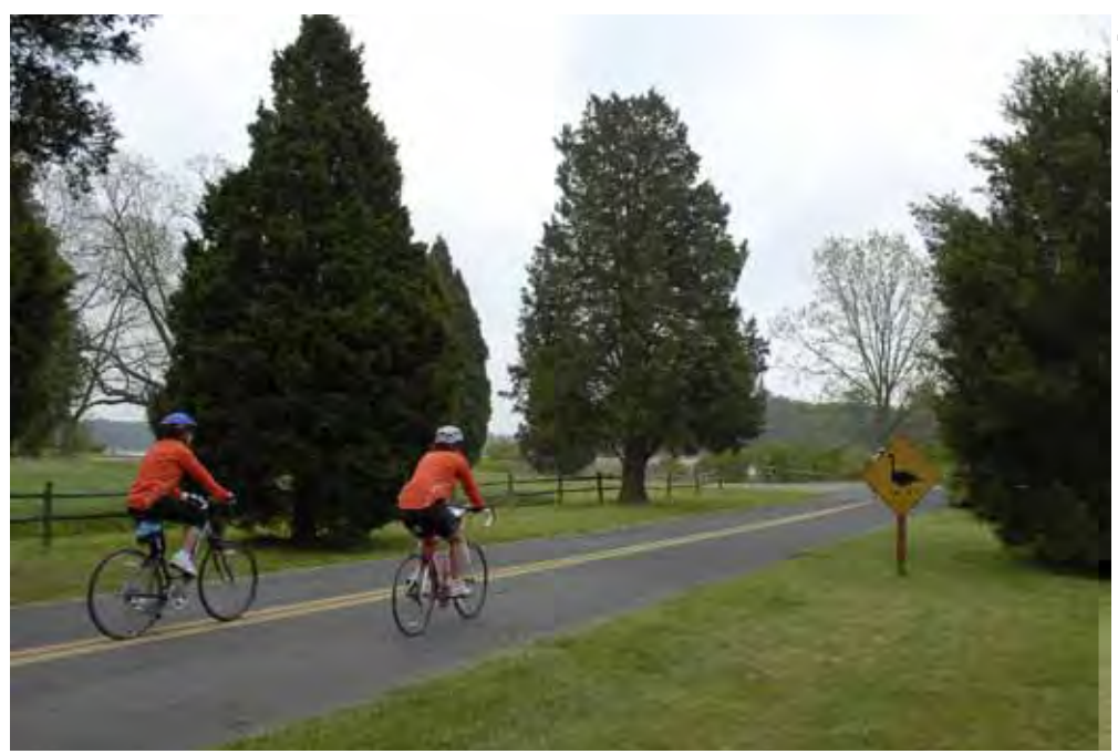
The annual Wild Goose Chase attracted 775 bikers in 2011 and raised more than $40,000 for the Friends of Blackwater National Wildlife Refuge, MD.

riends of the National Wildlife Refuges of Rhode Island raises $3,000 with a small wine tasting at the Westerly Yacht Club every June. Friends of Louisiana Wildlife Refuges celebrates National Wildlife Refuge Week with a Wild Things Festival, bringing in 4,500 people and more than $5.500 in a single day. Friends of Blackwater National Wildlife Refuge, MD, nets nearly $40,000 each year from a Wild Goose Chase bicycle ride.