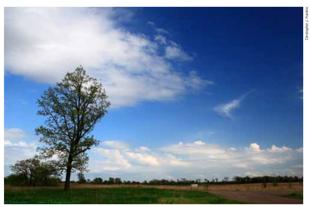
The Friends of Sherburne National Wildlife Refuge, MN, have been persistent, optimistic and flexible in fundraising.

With a somewhat changed economy in 2011-2012 we raised more than $20,000 in less than a year, the minimum required to draw annual grants from the proceeds from the endowment fund. Donors included a core group who pledged $10,000 and challenged the rest of the