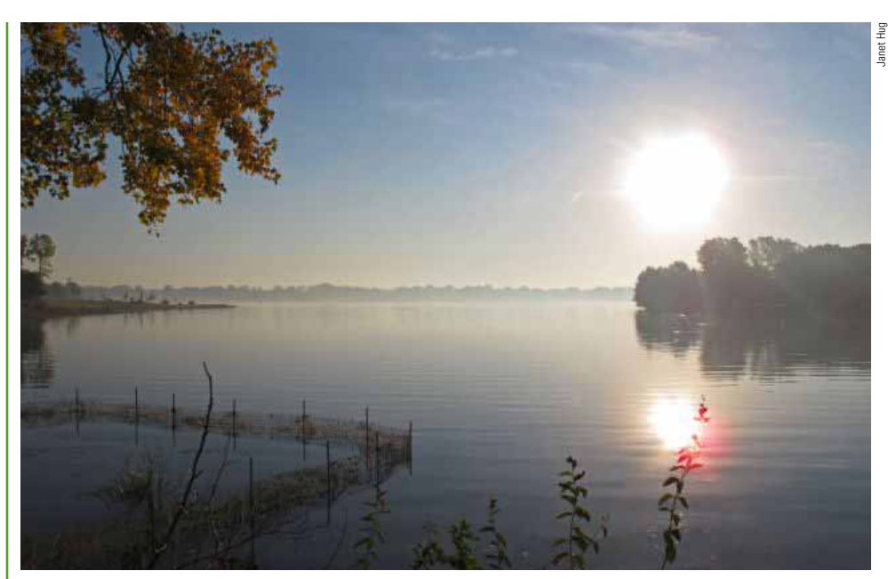
The International Wildlife Refuge Alliance in Detroit raises $60,000 by sailing the Detroit River to a Canadian island for an evening of dining, browsing and buying. (next page)

Online fundraising didn't exist when Beverly Heinze-Lacey wrote Building Your Nest Egg: An Introduction to Raising Funds for National Wildlife Refuge Support Groups in 2000. But her analogy to a bird's nest remains apt. Birds—and Friends—must have a plan with an expected outcome, use a variety of intertwined materials to make a solid structure, build relationships and nurture the result.