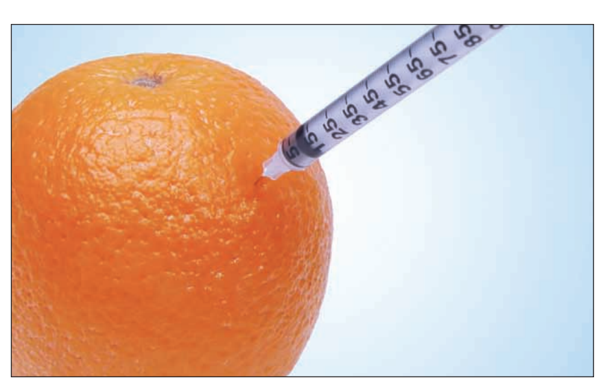
Researchers Debate the Role of IV Vitamin C as a Cancer Treatment

Vitamin C is commonly known to be essential to human health. However, specifically as it relates to cancer treatment, the value of vitamin C is debated and often considered a topic of scientific controversy. Cancer researchers have investigated various ways of administering high-dose vitamin C, including both orally and intravenously. Researchers have also examined different forms of vitamin C-ascorbic acid (AA) and dehydroascorbic acid (DHA)which may well be a comparison of apples and oranges.