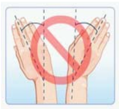
Figure 4: Bending of wrist can cause longterm problems

4. Your mouse should also be as close to the keyboard as you can get it. The idea is to avoid reaching to the side to move the mouse, as is depicted on the left, (also labeled Figure 3). If you don't use your number keypad, consider placing a cover over it and place the mouse above it. That arrangement will keep your elbow near your side, which is where it should be.