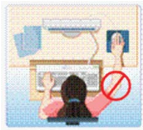
Figure 3: Improper placement of the mouse

2. The "ideal typing position" also demonstrates a good linkage for the wrists. Notice that they are straight. Wrists must not bend backwards (toward the ceiling). That position can cause pain, interfere with blood flow, and even affect the nerves in the hands.