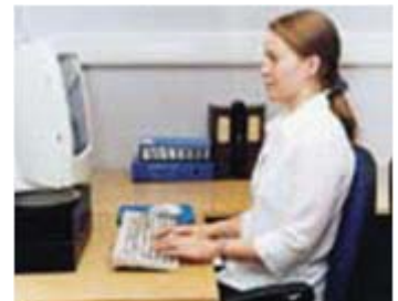
Figure 1: Sitting in an "open posture"

Adjust the height of your chair so it's low enough for you to rest your feet on the floor and so you will be able to move your legs often. Make sure you remove items stored underneath the desk that restrict knee space. Be sure the front of the chair doesn't apply pressure to the back of your legs. You might be more comfortable if your knees are a little higher than your hips.