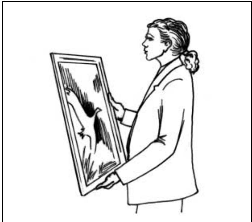
Figure L.2. Proper way to carry a small painting

For more information on handling, see Chapter 6: Handling, Packing, and Shipping.