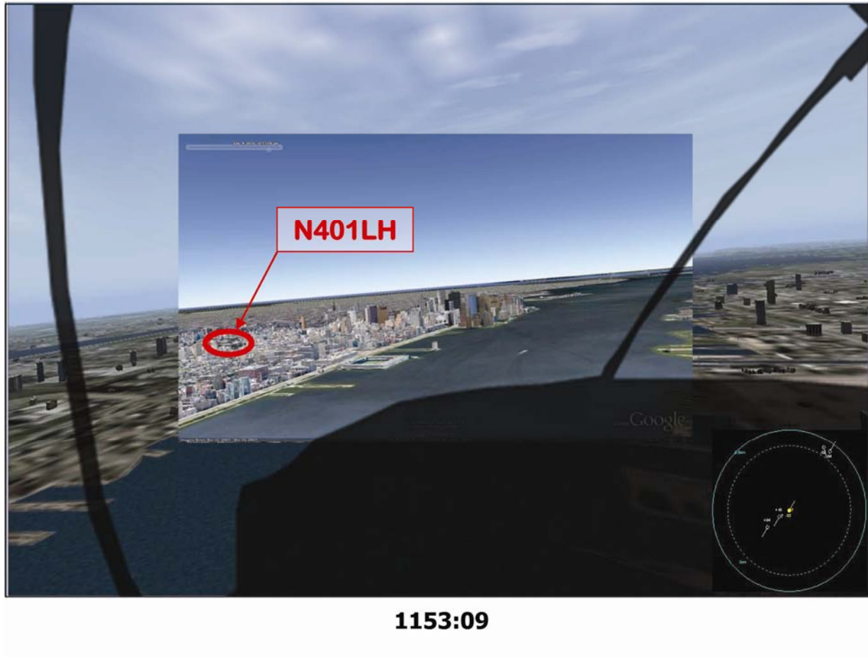
Figure 4. View of helicopter from airplane cockpit about 5 seconds before collision.