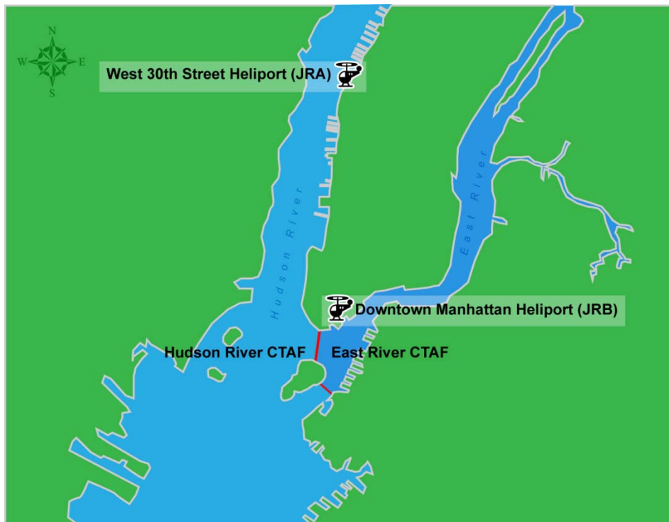
Figure 6. Location of West 30th Street and Downtown Manhattan Heliports and Boundary Between Hudson River and East River common traffic advisory frequencies.

The NTSB concludes that pilots operating air tour helicopters to and from JRB may not be fully aware of other aircraft operating over the Hudson River because the CTAF used for such flights is for the adjacent East River area. Therefore, the NTSB recommends that the FAA redefine the boundaries of the East River CTAF so that JRB will be located in the area that uses the Hudson River CTAF.