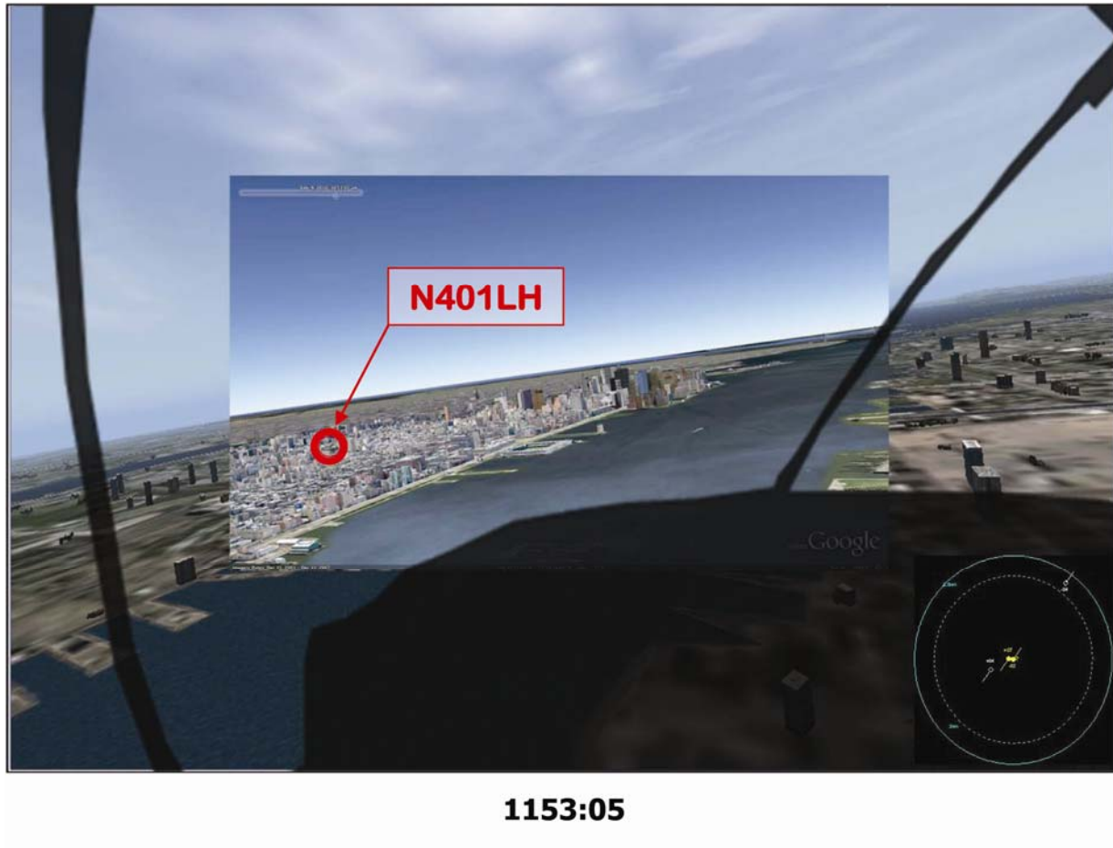
Figure 3. View of helicopter from airplane cockpit about 9 seconds before collision.

labeled “00,” indicating no vertical separation. The displayed traffic information is further discussed in section 2.2.2.