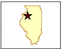
Figure 2-1 Anderson Farm Training Area Location and Operational Range Area