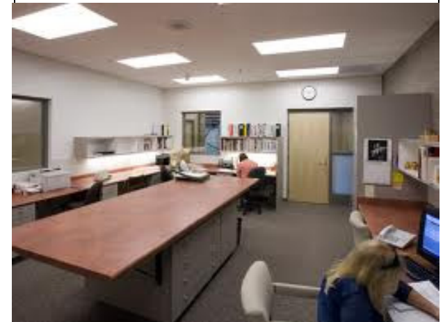
► Professional Development Center: Northwest Middle School, VCBO Architecture, Salt Lake City, UT

NOTE: Images shown are intended to provide real-world examples and spark design creativity.