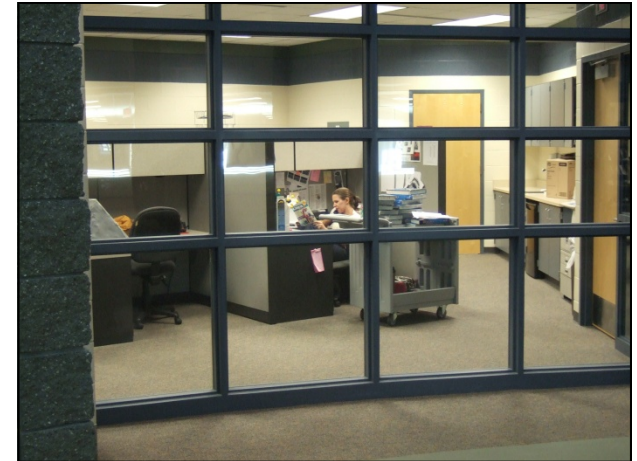
► Professional Development Center: Zeeland West High School, GMB Architects, Zeeland, MI