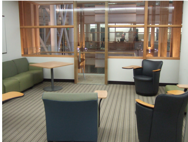
► Professional Development Center: Hudson Alpha Institute for Biotechnology, Cooper-Carry Architects, Huntsville, AL

The central workroom provides space for large reproduction equipment and items such as a die-cut machine, laminator or other specialized equipment that cannot be distributed to the neighborhoods. Provide layout space convenient to the reproduction equipment. Provide casework as required for specialized items such as the die-cut machine and templates. This noisy area should be acoustically separated from any adjacent areas as needed. Typically, a fairly square room with a central work table and built-in cabinets on one wall works well. This leaves open floor space for large copiers and printers.