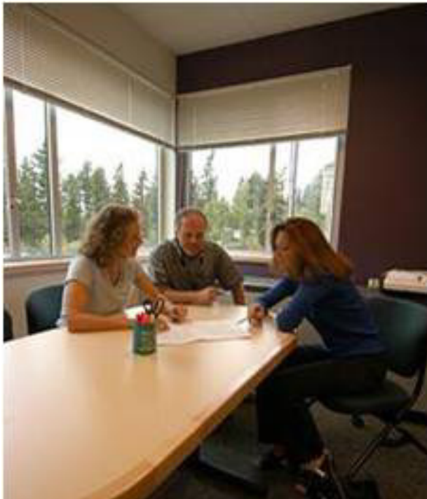
► Conference Room: Hudson Alpha Institute for Biotechnology, Cooper-Carry Architects, Huntsville, AL

Provide storage area, preferably accessible from the technician/waiting area or the internal hallway within the suite. Provide shelving for storage of testing materials and supplies.